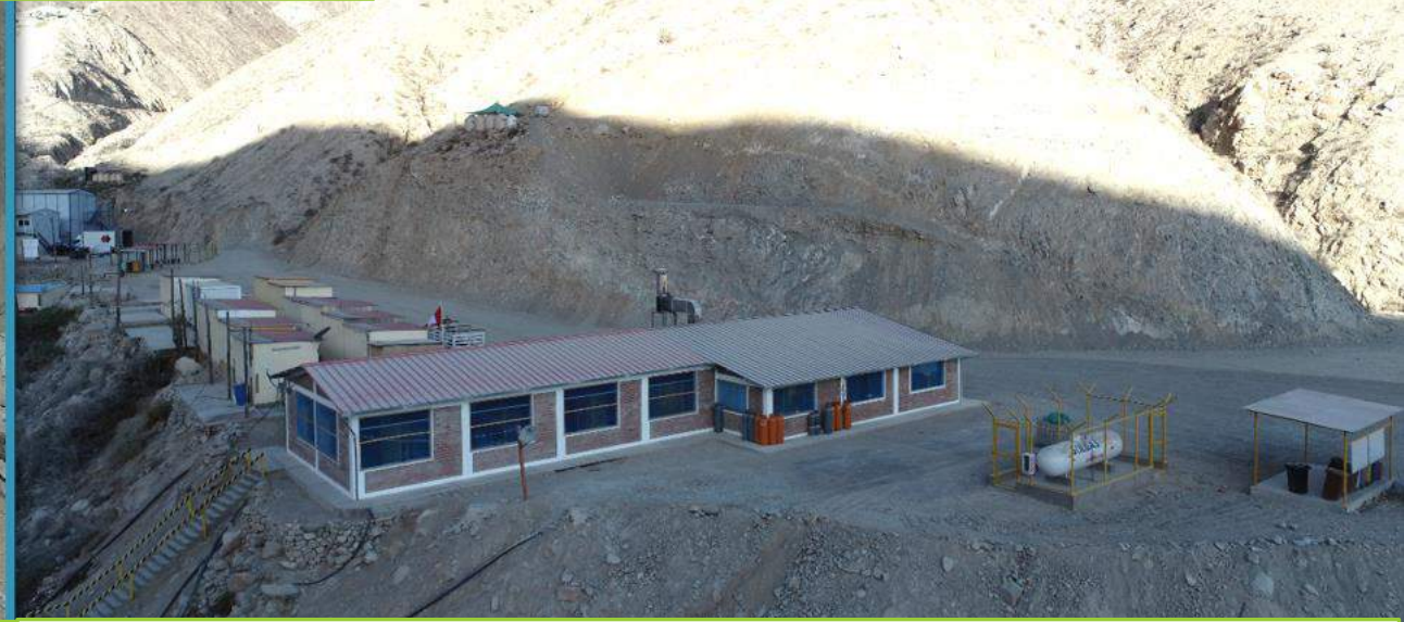
MINE REFRATORY— ESPERANZA