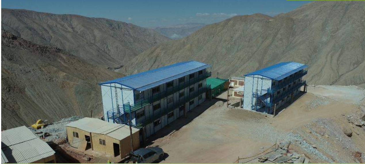
MINE CAMP— CERRO RICO