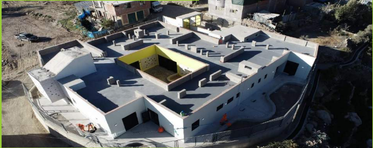
HEALTH CENTER ISPACAS