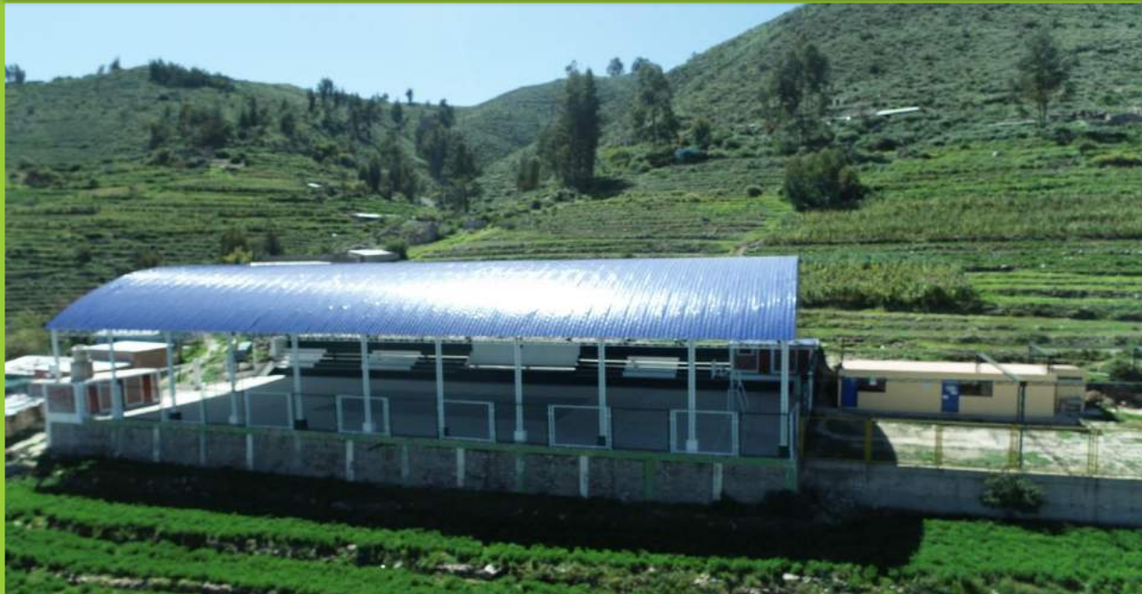
SPORT CENTER QUIROZ-CHARCO