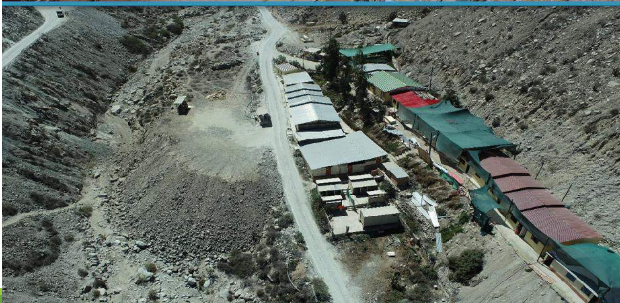
MINE CAMP ESPERANZA