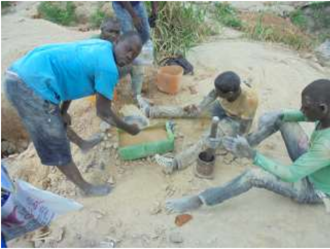
Method of gold detection