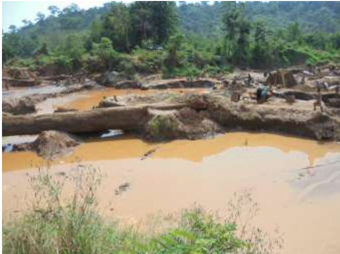
Surface water pollution