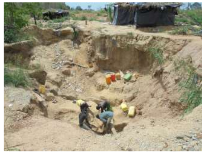
Destruction of vegetation cover