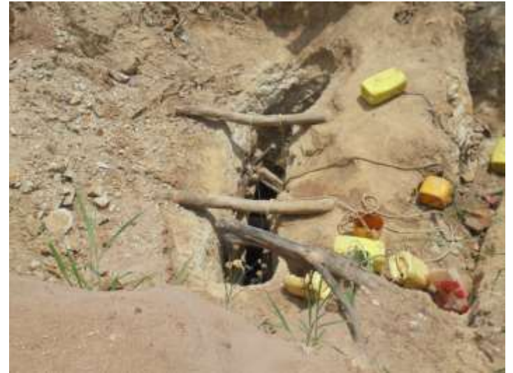
Presence of dangerous wells

Illustration of the situation of the environment